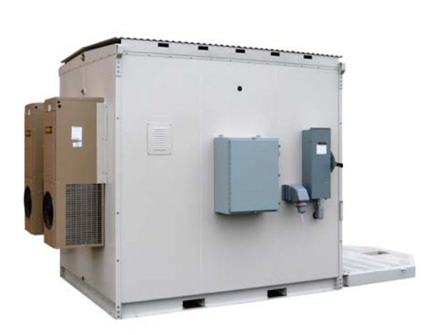
Optional wall mounted air conditioners, emergency generator connection system, and special hinged satellite dish mounting platform shown.